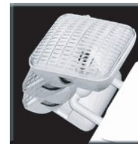
Adjustable lamp heads rotate 180° for maximum field flexibility.